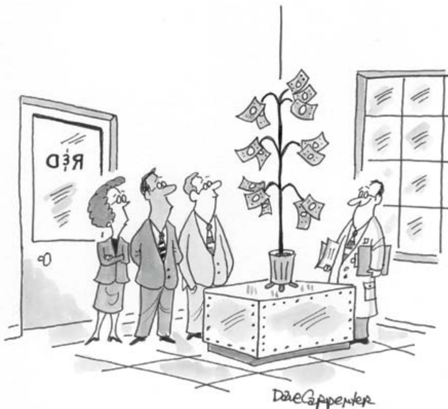
“We’re still hammering out the details with the Treasury Department.”